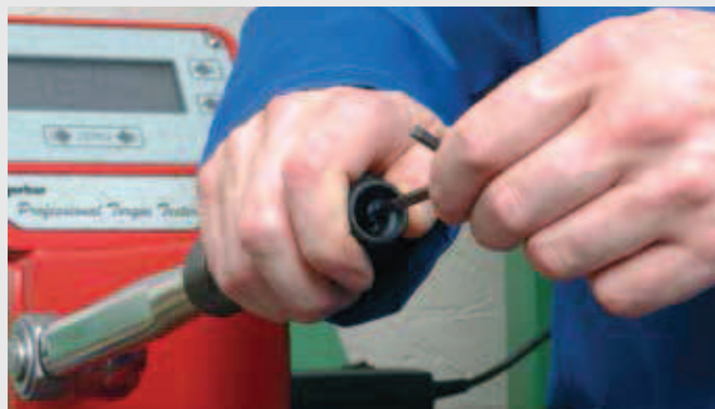
Setting a 'P' Type Torque Wrench