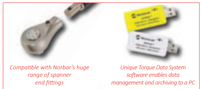
Compatible with Norbar's huge range of spanner end fittings