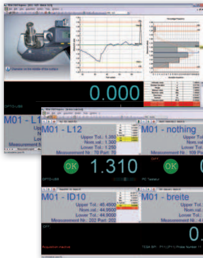
Measuring display with the option of adding operational instructions, accompanied with a photo or drawing

STAT-EXPRESS offers the ability to create reports including measured values obtained from a single instrument or several handtools, assign tolerances, calculate statistics, print out various measurement reports, compute XR control charts, and much more.