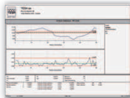
XR Control chart