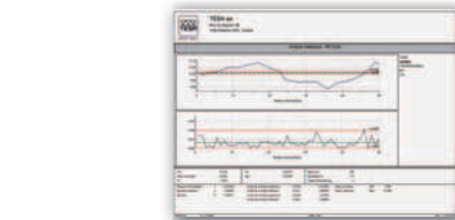
Simultaneous data acquisition from several measurement programmes

Please contact your TESA representative or an authorised distributor for a 30-day demo version.