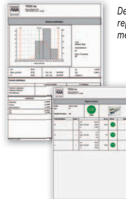
Detailed measuring report for each feature measured