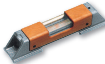
Model C: horizontal precision level