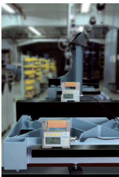
When 2 CLINOBEVEL 2 are connected, one of the instruments becomes the reference