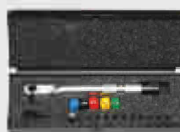
Model 5 'P' Type in storage case

Also available as Production 'P' Types, preventing unauthorised alteration of torque setting. No external calibration equipment is required to set the Model 5 'P' Type.